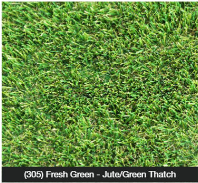
(305) Fresh Green - Jute/Green Thatch