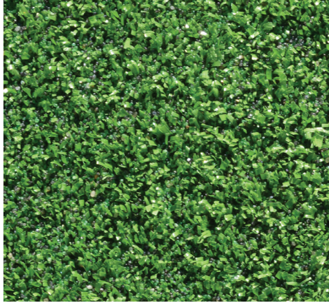
Color in photo: American Field Green (300)