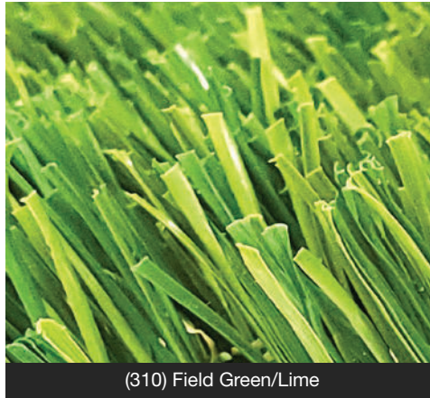
(310) Field Green/Lime